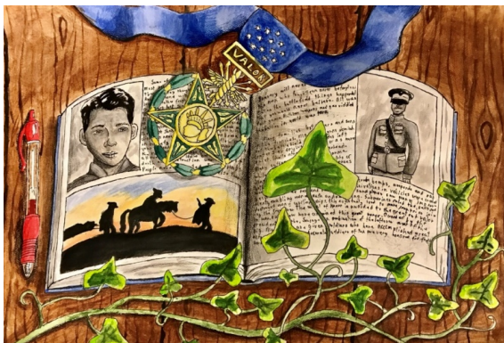
Josiah P., Greenville, SC

CREATE a scene that shows appreciation for freedom and independence. You might draw a veteran and express gratitude for how that individual protected freedom in the United States or abroad. You might draw an Independence Day celebration that shows a community celebrating joyously.