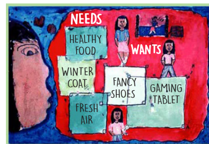
Balancing wants with needs