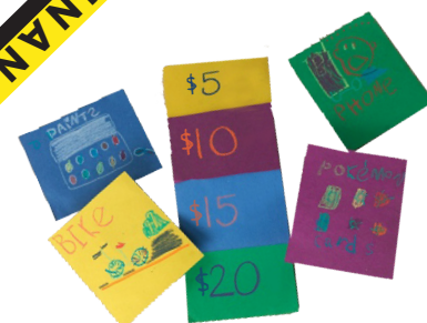
Plan for purchases

PRESENT your art to family and friends and explain the money mishap you drew and how you can protect yourself from it.