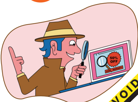
Savvy shopper detective