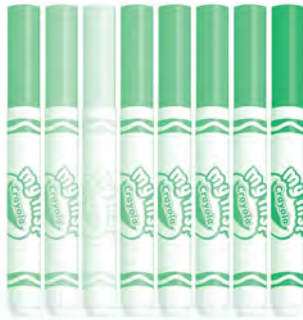
8 Washable Markers