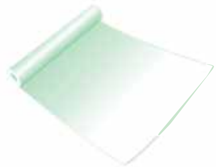
25ft (7.6m) Paper Roll