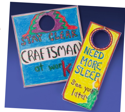
Dad's Door Knob Hangers

PRESENT your gift to this special person and give it a pizzazzy name. For example, for an avid reader you might use leaves to decorate a piece of cardboard and call your gift the Leaf Time to Read Bookmark , reminding them to leave time to enjoy a good book. Or if Dad needs some quiet time, call your gift Dad's Door Knob Hangers that will keep disruptions away when he's sleeping or working on a hobby. Or call small pieces of art that can be attached to a tackle box or golf bag, Special Together Time Charms .