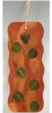
Leaf Time to Read Bookmark