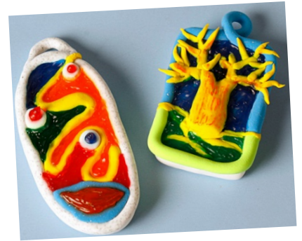
Special Together Time Charms